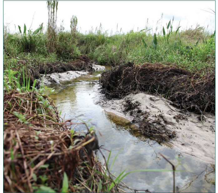
Mosaic enhances stream habitats like this one by planting wetland sod along the banks to develop wetland floodplain systems that connect to adjacent upland areas.

Once the foundation has been established, the process of revegetation begins. On many reclaimed stream sites, Mosaic relocates desirable native vegetation from donor sites (often sites permitted for mining) and constructs upland buffers surrounding stream systems to enhance wildlife corridors as well as connect other habitats. To help establish floodplain vegetation, Mosaic