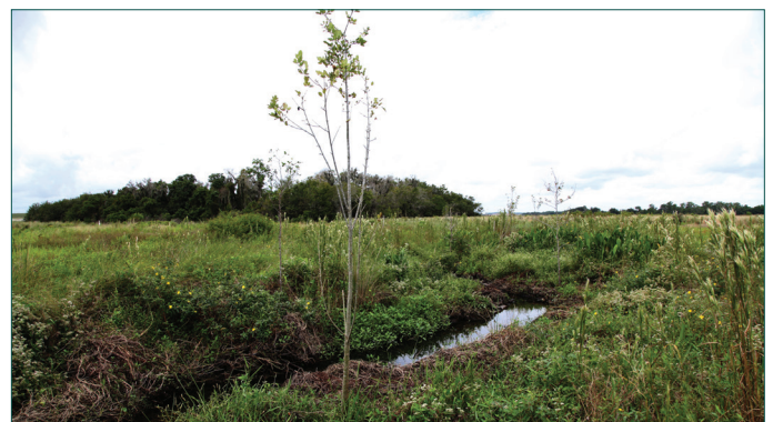
Mosaic designs reclaimed streams to return the systems to a more natural state.

Whether carved hydraulically or constructed mechanically, streams constructed using the current state of the science have been extensively measured and monitored by applying stream habitat and condition assessment methods developed by the Environmental Protection Agency and the Florida Department of Environmental Protection (FDEP). <