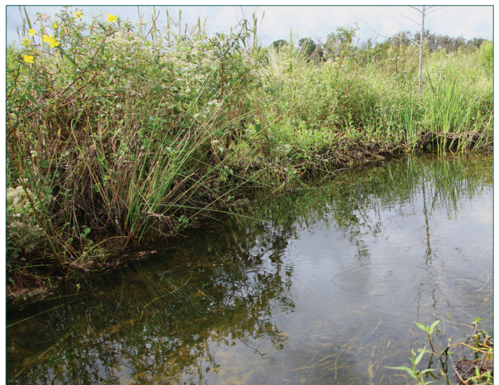
If streams that connect wetland systems do not deliver the needed water, those habitats will not thrive.

All photos were taken at Maron Run and Little Manatee River No. 8 (LMR8), reclaimed perennial streams located in Polk and Hillsborough counties respectively.