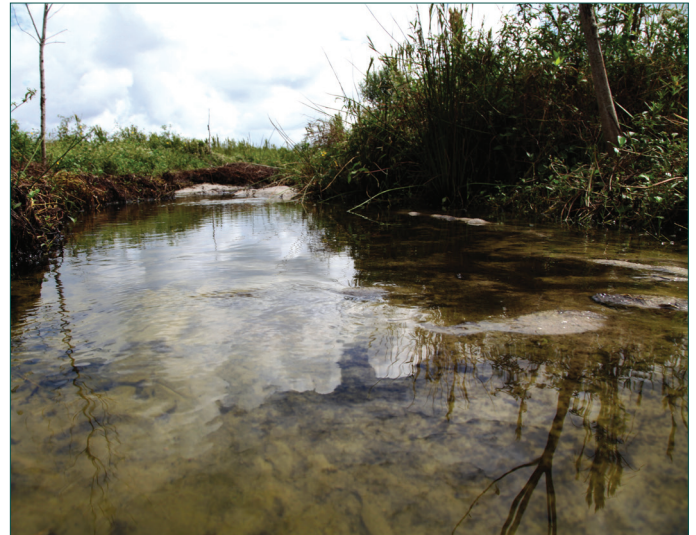
In Mosaic’s reclamation projects, we connect stream systems with wetlands and lake systems, providing wildlife corridors and aquatic habitats.

Two examples of successful perennial stream reclamation are Mosaic’s Maron Run and Little Manatee River No. 8 (LMR 8) sites located in Polk and Hillsborough counties respectively. Maron Run is a “downstream segment” whereas LMR 8 is a “headwater segment.” <