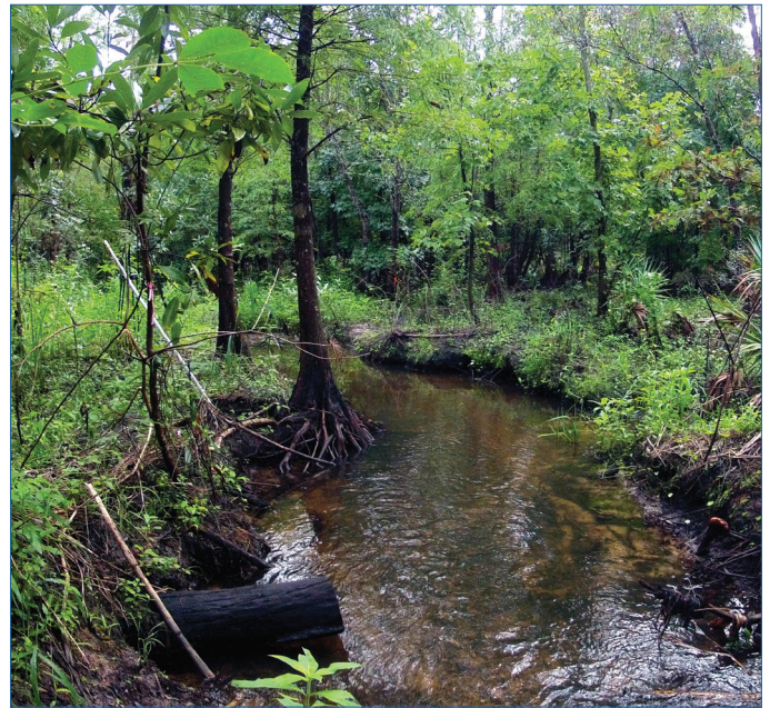
The Maron Run headwater tributary was reclaimed with a variety of wetlands communities, helping regulate the quality and quantity of water entering the Maron Run system.

prairies. Reclamation also offers an opportunity to enhance the broader quality of lands that were drained or otherwise affected by development, agricultural or other land uses many years before mining ever began. Mosaic designs its reclamation plans from a holistic perspective. The plans are centered upon creating a diversity of habitats that provide wildlife a place to call home, and increase the sustainability of the broader regional ecosystem. <