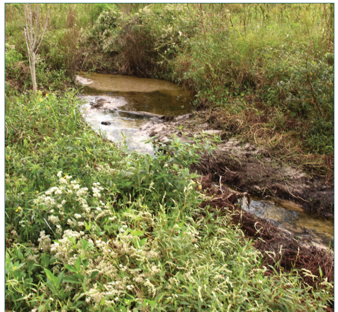
Plants within a wetland system are highly dependent on how much water they receive and retain.