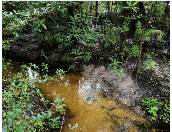
Each variety of wetland habitat contains unique plant species that require differing amounts of water at the right times of year for support.

With public funding unable to fully support expensive conservation land acquisition programs, mining and stream restoration may also provide permanent protection through conservation easements to help ensure the availability of high-quality habitat for generations to come. <