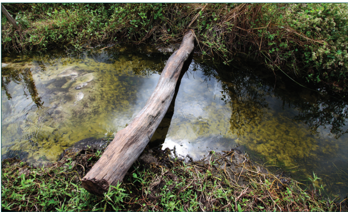
The addition of woody debris to a reclaimed stream helps to create aquatic and macroinvertebrate habitat.

Determining the success of a reclaimed perennial stream includes the evaluation of several factors, including water flow characteristics, water quality, and appropriate breeding and foraging areas for fish and insects. Independent assessments of Maron Run and LMR8 applying the Florida Department of Environmental Protection Stream Condition Index (SCI) methodology found both streams to be “healthy.” SCI is a biological assessment procedure that measures the degree to which flowing fresh waters support a healthy, well-balanced biological community, as indicated by benthic macroinvertebrates. <